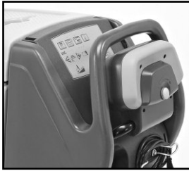
Ergonomic and safe paddle system for operator comfort