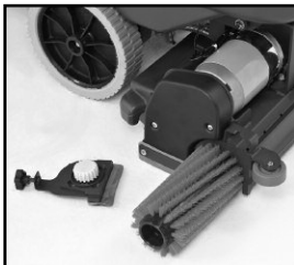
Tools-free removable brushes