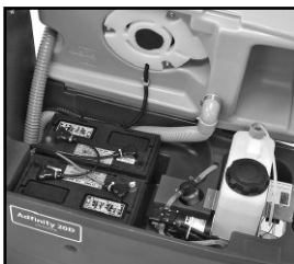
Access to batteries and AXP onboard dispensing system